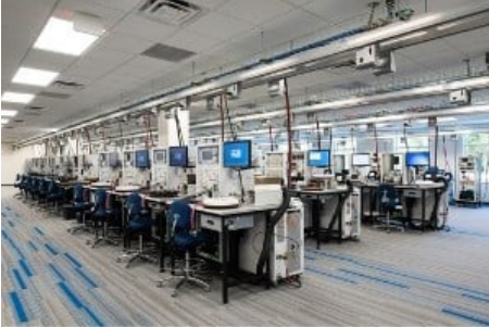
Electronics Manufacturing and Handling