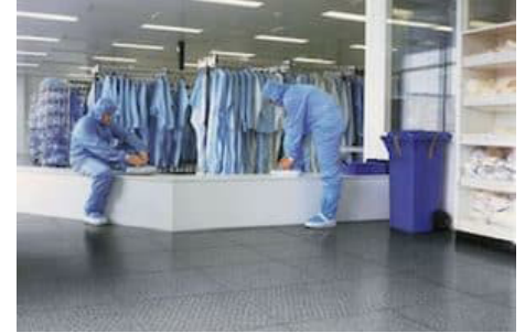
Cleanrooms and Labs

plus data centers, university labs, medical facilities, and more.