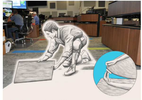
Figure 1: Installing ShadowFX with TacTiles in a 24/7 mission-critical environment.