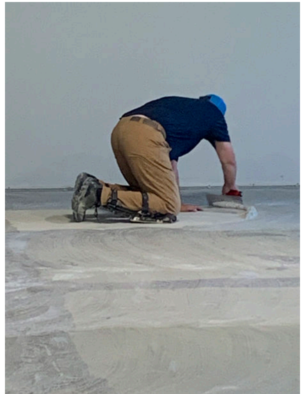
Figure 2: Adhesive installation

Sealers: The use of sealers on floor surfaces is generally not necessary except for sanded, dusty, porous, and acoustical surfaces. Sealing cannot overcome moisture conditions and must not be used for that purpose. When used, sealers must be thin and fast drying. They should be compatible with adhesives, which should be applied only after sealer is dry.